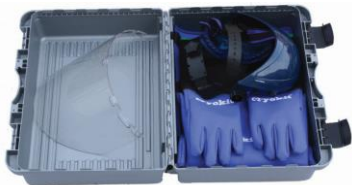
Cryogenic safety equipment