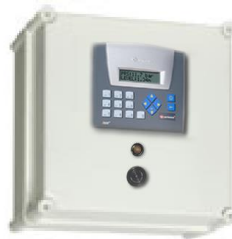
O2 depletion alarm