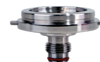
190100-74 Adaptor for Sartorius disposable plastic funnel