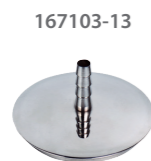
167103-13 Stainless steel cover for 300ml funnel