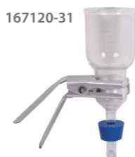
167120-31 300ml Glass filter holder