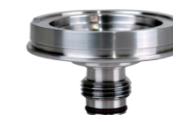
190100-75 Adaptor for Pall disposable plastic funnel