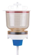
200300-01 300ml MF 3, Magnetic filter holder