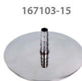
167103-15 Stainless steel cover for 500ml funnel