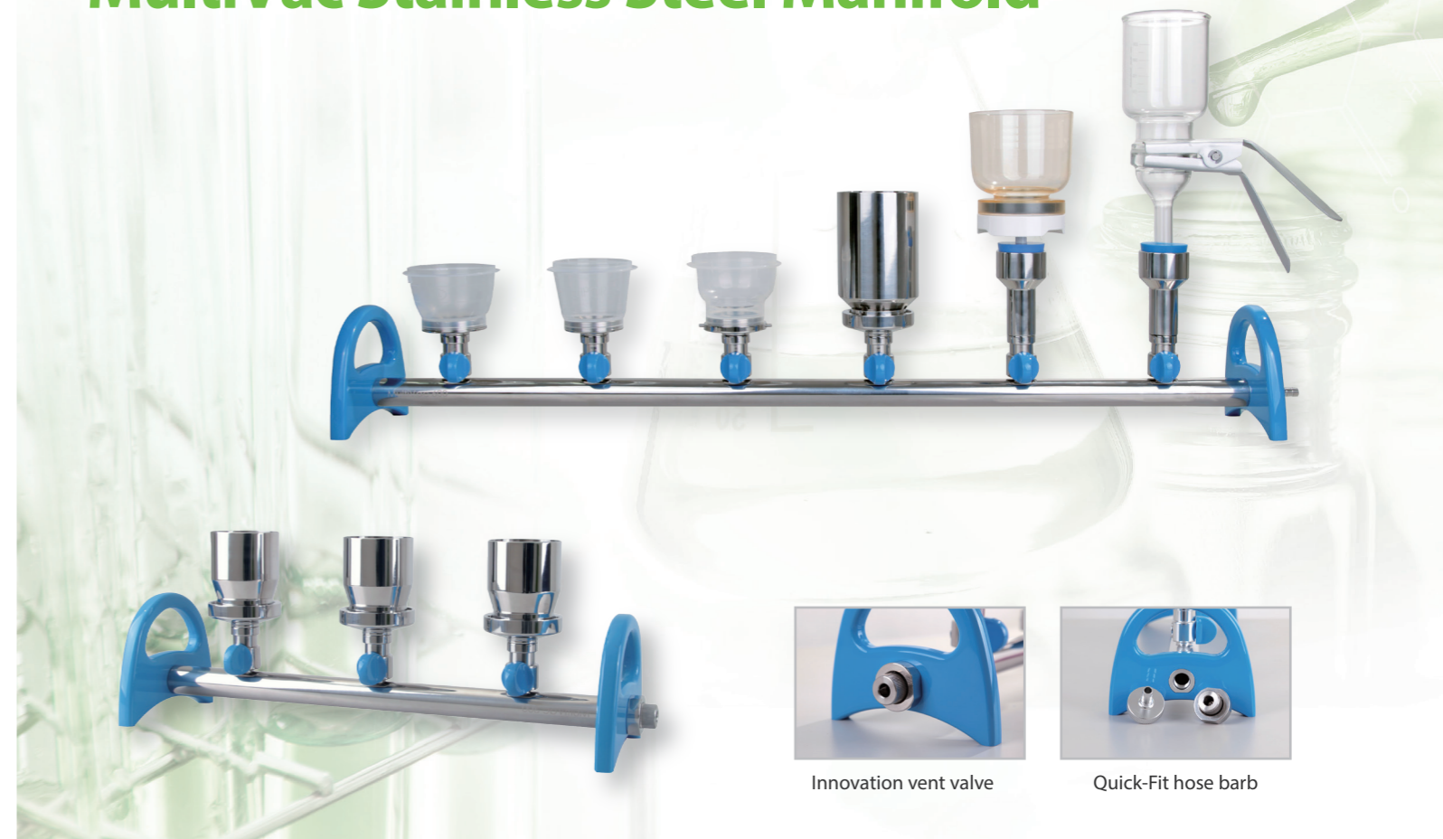
MultiVac Stainless Steel Manifold