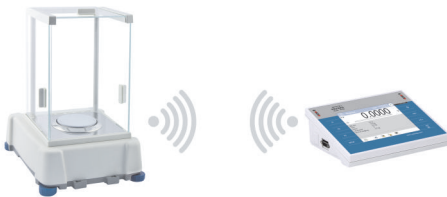
Additionally option: AS xx.3Y.B

✓ Removable glass parts: side, top and back!