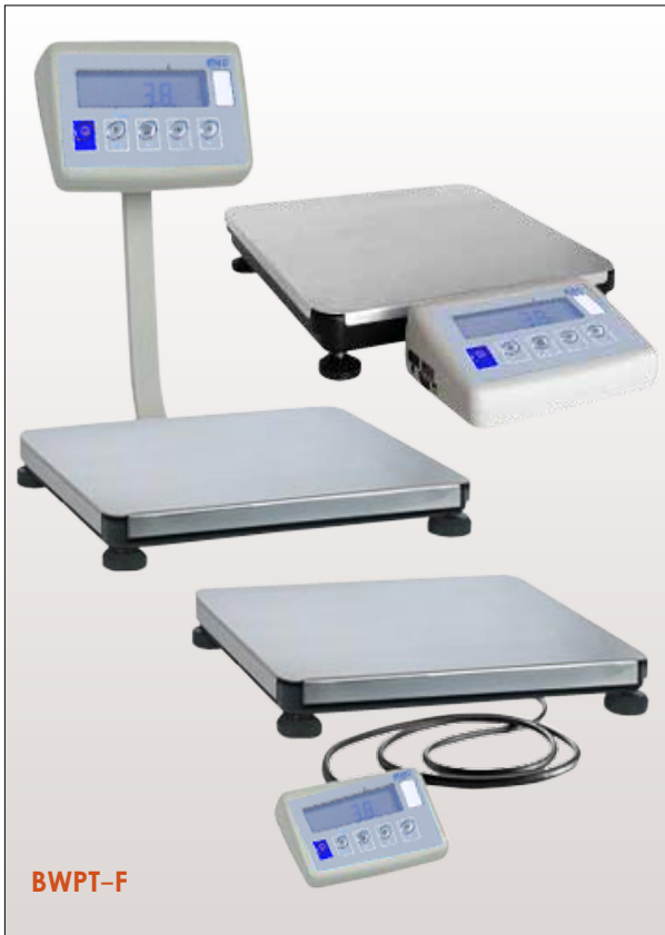
Table scales Series BWPT-F are designed for fast and precise mass determination. Tarring in the whole measuring range allows to determine Nett Mass of the weighed loads.

Scales feature low-profiled esthetic construction with Type-31 measuring indicator equipped with backlit, LCD display. Their standard equipment includes one RS 232 interface, internal rechargeable NiMH accumulators, and a power adapter. Scales Series/F can be made with a measuring indicator on a pillar, cable or fixed to the construction.