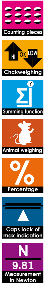
Table scales Series BWPT-F can cooperate with PC software, which contains the essential information on weighing indicated on the display. It also allows editing & modifying all the user parameters from the level of PC. Optionally, the scales have possibility of weighing loads outside the weighing platform (so called under hook weighing). It is an alternative, for the loads with non-standard dimensions, shapes or emitting electromagnetic field. Extra equipment comprises additional display. It is used for controlling mass of the weighed load by third party.

Scales feature low-profiled esthetic construction with Type-31 measuring indicator equipped with backlit, LCD display. Their standard equipment includes one RS 232 interface, internal rechargeable NiMH accumulators, and a power adapter. Scales Series/F can be made with a measuring indicator on a pillar, cable or fixed to the construction.