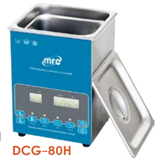
DCG-80H With degas function