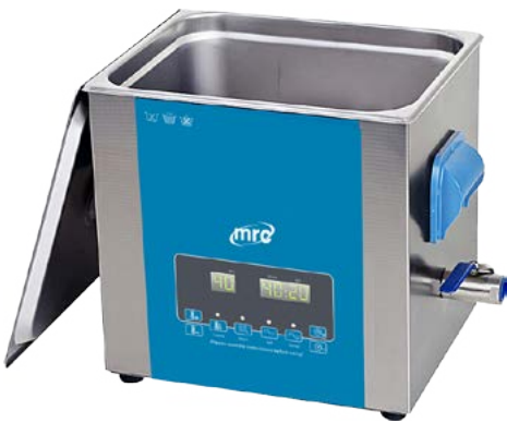
DCG-200H With degas function