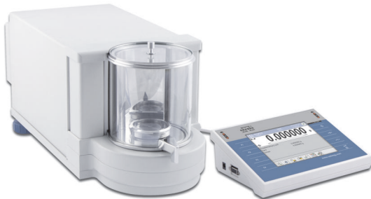
MYA 2.4Y (standard solutions for any operating conditions)

4Y series is a modern weighing device, especially useful when the measurement requires perfect accuracy and high speed.