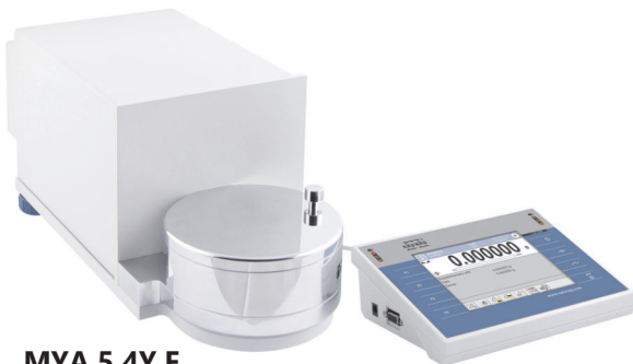
MYA 5.4Y.F (filters weighing)