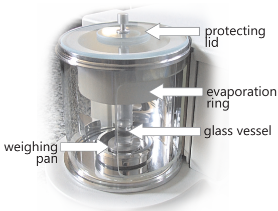
MYA 21.4Y.P (control of piston pipettes volume)