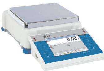
PS 6100.3Y - PS 10100.3Y