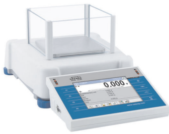
PS 200/2000.3Y - PS 1000.3Y