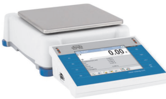
PS 1500.3Y - PS 6000.3Y