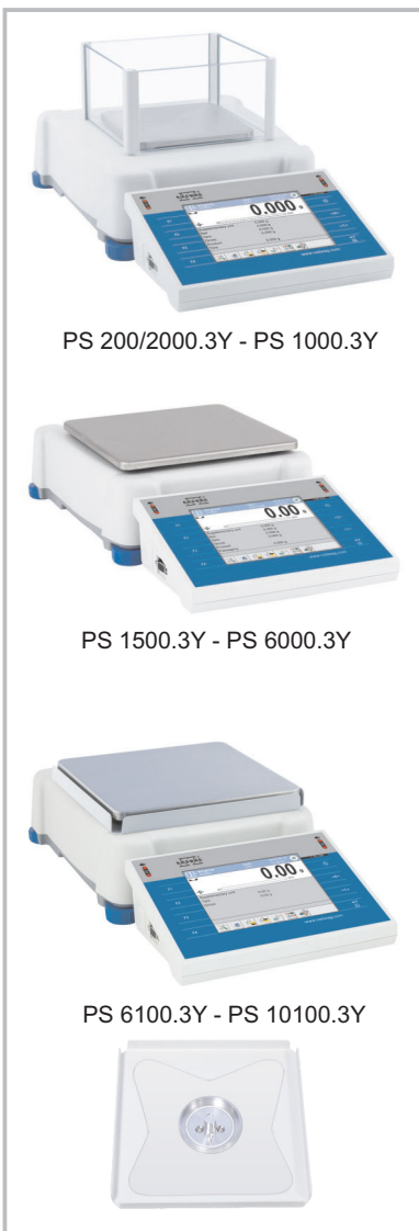
PS 200/2000.3Y - PS 1000.3Y